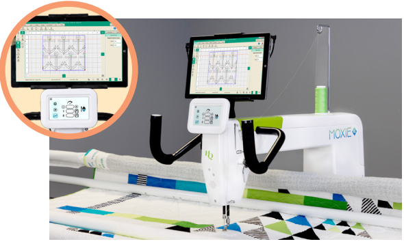
Plug & Play Computerization Ready for Pro-Stitcher Lite, right out of the box for the most accessible computerized quilting system available.