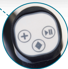
Independently-adjustable handlebars with programmable buttons