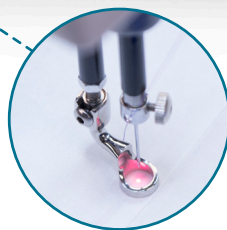
Pinpoint needle laser