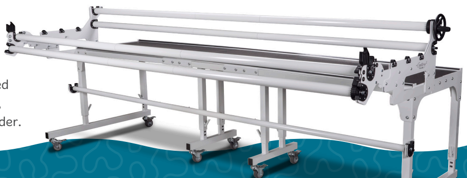
10-foot Gallery2 Frame with optional casters. *14-foot Extension kit available late 2018.

The HQ Forte 24-inch longarm machine with HQ Gallery2 Frame™ (choose from 10- or 12-foot size options*). Everything you need for free-motion quilting right out of the box, including a powerful stand-alone bobbin winder.