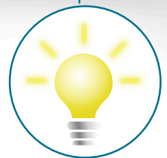
QuiltMaster™ LED lighting: throat, needle, and bobbin