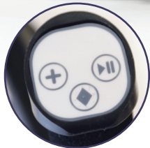
Independently adjustable handlebars with programmable buttons