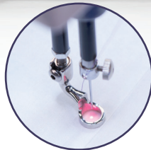
Pinpoint needle laser