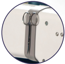
Magnetic tool minder collar