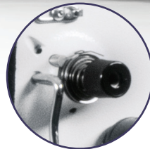
Easy-Set Tension TM