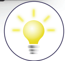
QuiltMaster TM LED lighting: throat, needle, and bobbin