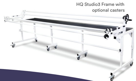
HQ Studio3 Frame with optional casters

The Amara 20-inch longarm machine with HQ Studio3 TM Frame (12-foot size) has everything you need for free-motion quilting right out of the box, including a powerful, Handi Quilter standalone bobbin winder.